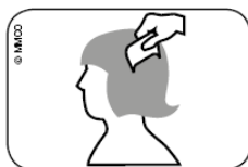
Illustration: Combing the wet hair out from the scalp to the ends with the lice comb